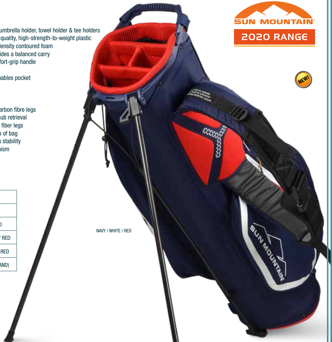
NAVY / WHITE / RED