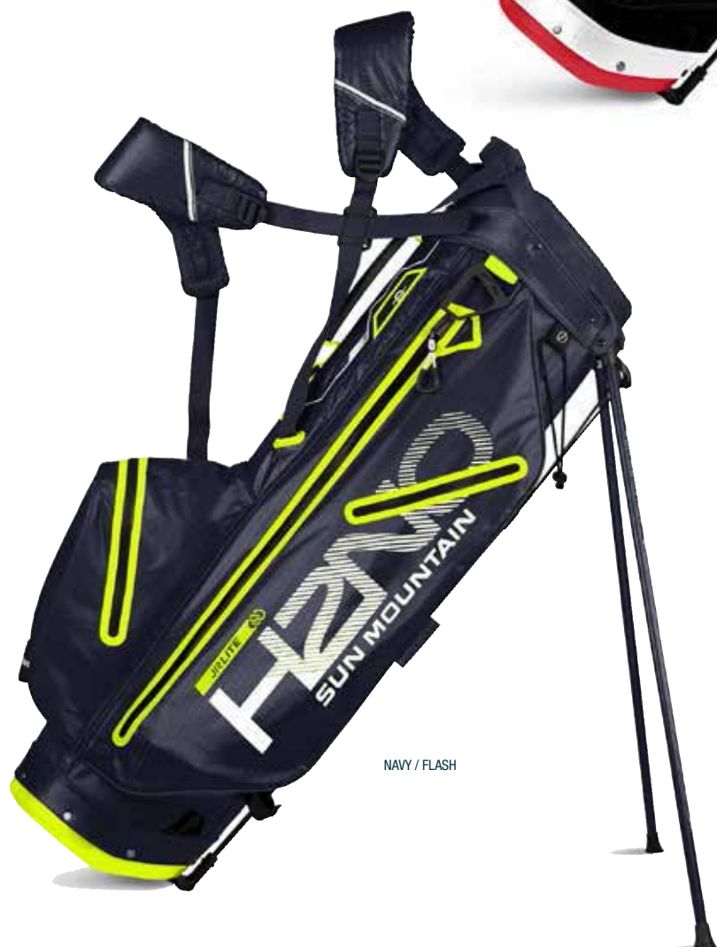
NAVY / FLASH