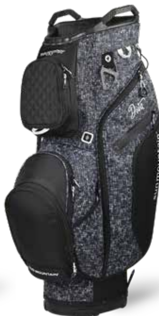
BLACK / KNIT