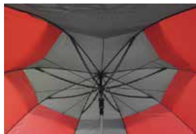
Detail showing extremely high quality construction