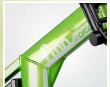
Built to last