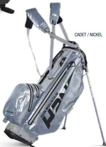
CADET / NICKEL