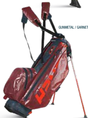
GUNMETAL / GARNET / INFERNO