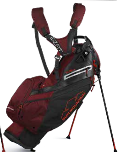
GARNET / BLACK / INFERNO