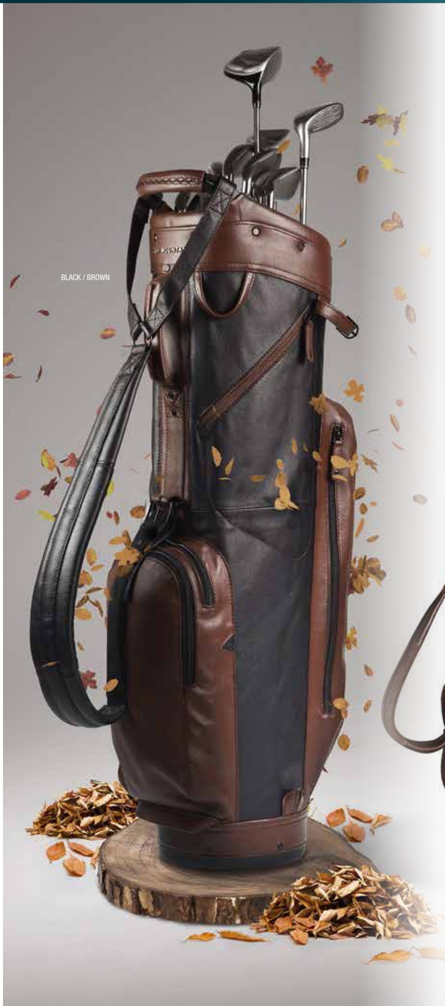
BLACK / BROWN