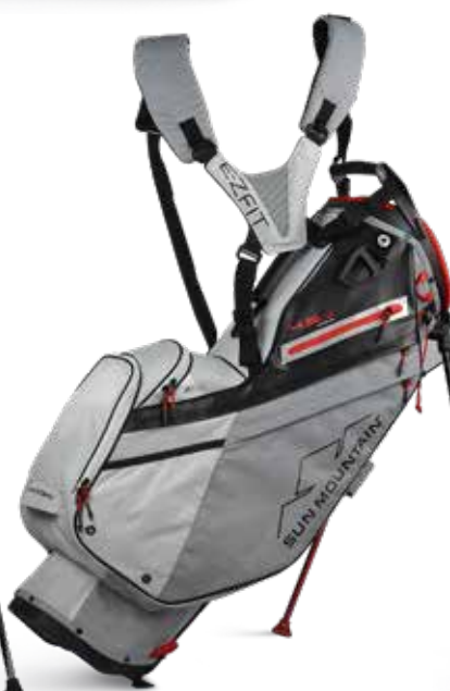
CHARCOAL / WHITE / BLACK / RED