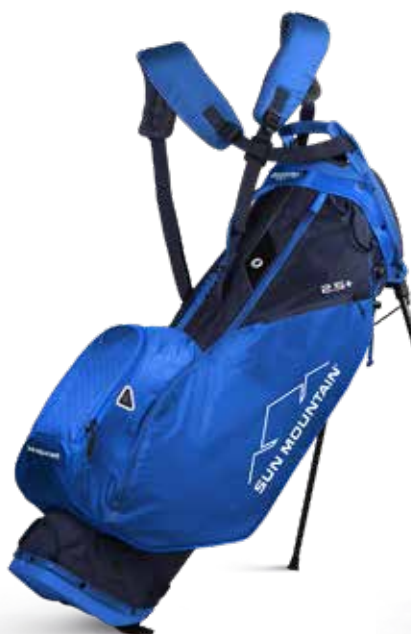
COBALT / NAVY