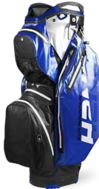
BLACK / BLUE / WHITE