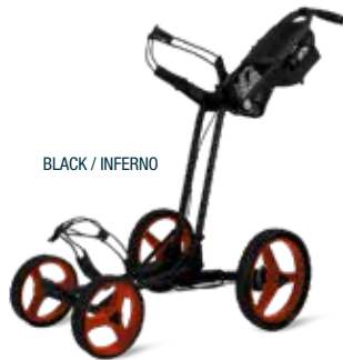
BLACK / INFERNO