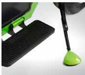
Footplate and stand