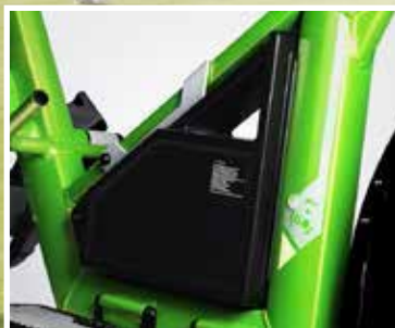
Rechargeable lithium battery