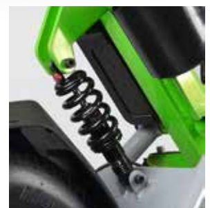
Suspension for a comfortable ride