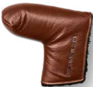
7LEPUT-BT BROWN / TAN