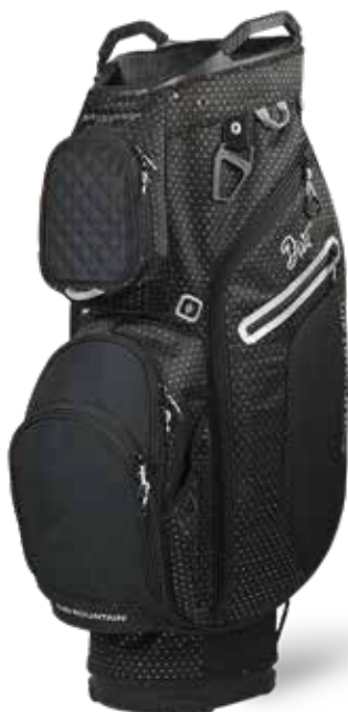
BLACK / DIAMOND