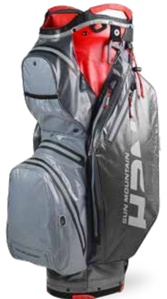
NICKEL / GUNMETAL / RED