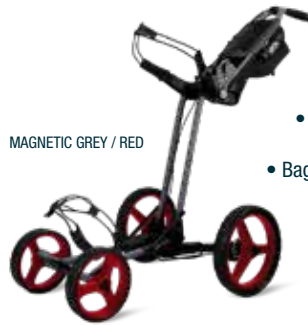
MAGNETIC GREY / RED