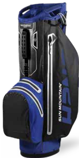
BLUE / BLACK