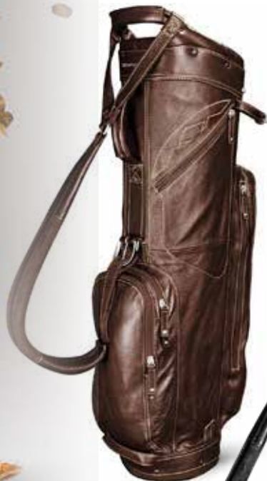
DARK BROWN / KHAKI