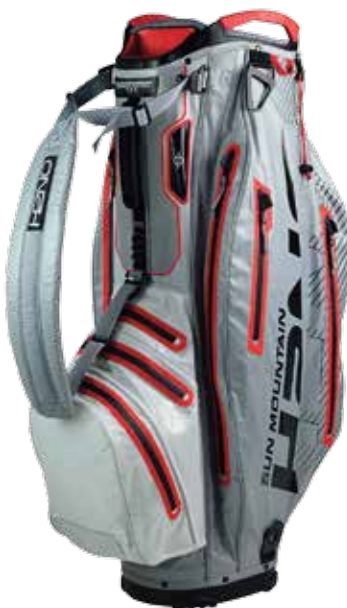
GREY / WHITE / RED