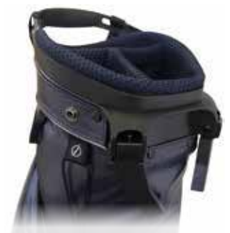
Retractable 'stubby legs' - keeps bag off the ground during play