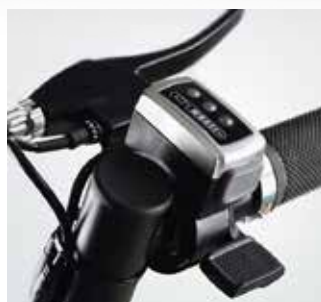
Throttle, power indicator and brake