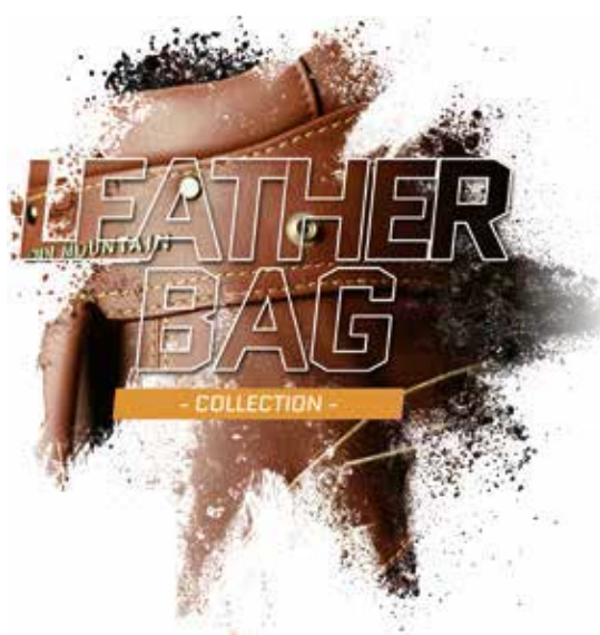
DARK BROWN / KHAKI

With the leather range, Sun Mountain delivers unparalleled quality and functionality.