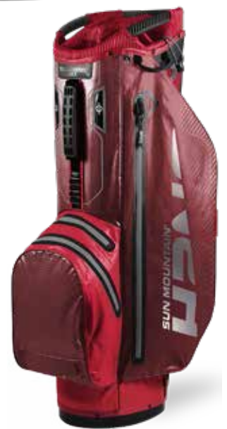
RED / GARNET