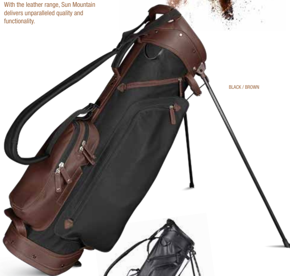
BLACK / BROWN