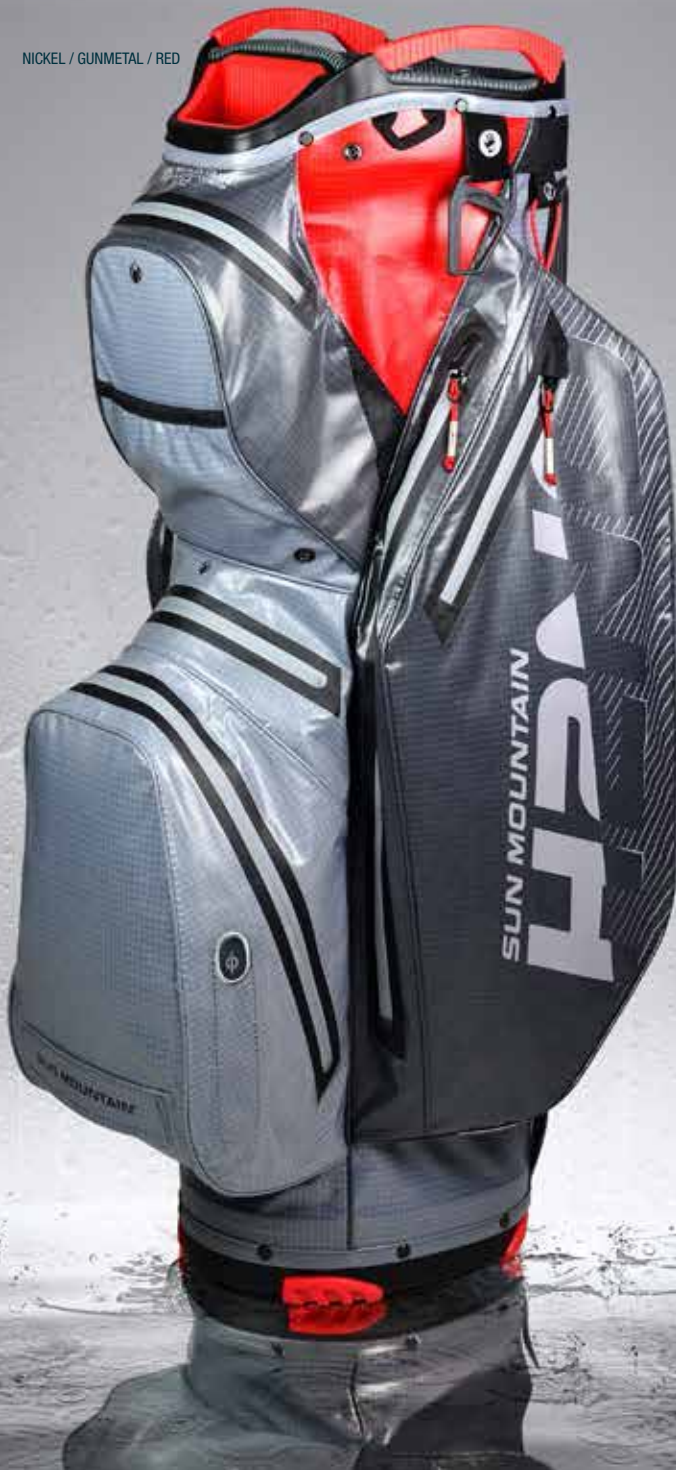
NICKEL / GUNMETAL / RED