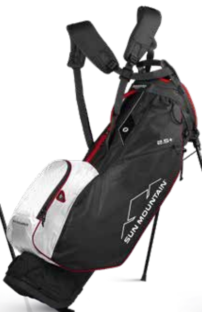
BLACK / WHITE / RED