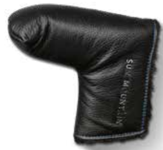
7LEPUT-KC BLACK / COBALT