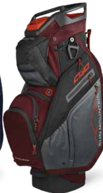
BLACK / GARNET / GUNMETAL / INFERNO