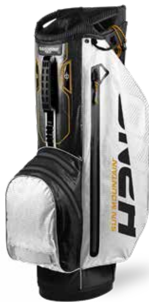
BLACK / WHITE / GOLD