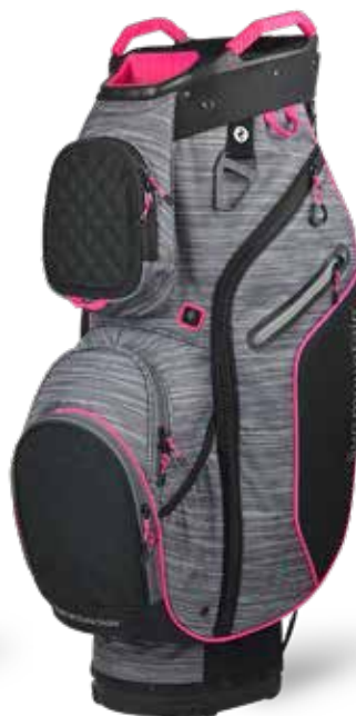
BLACK / CARBON / PINK