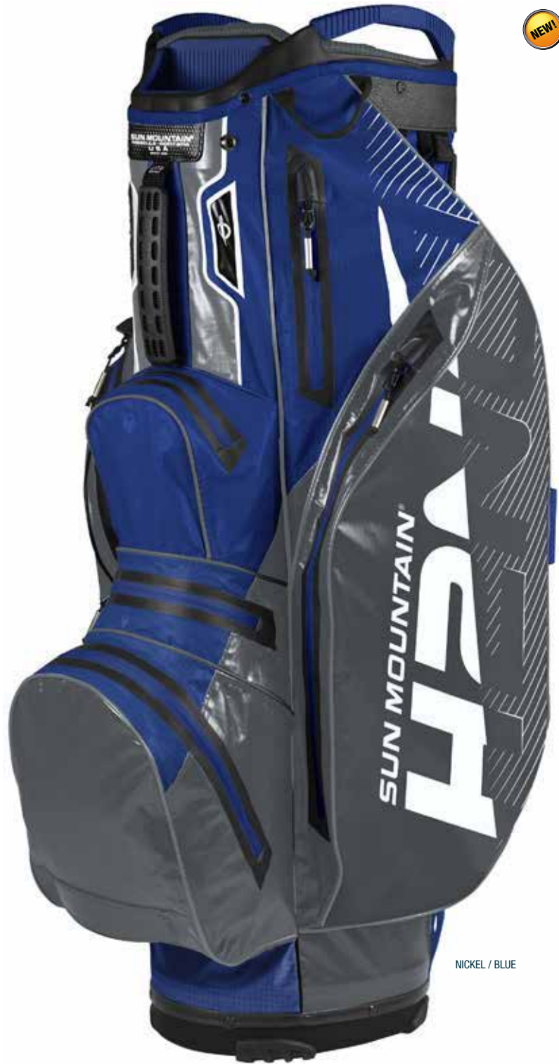
NICKEL / BLUE