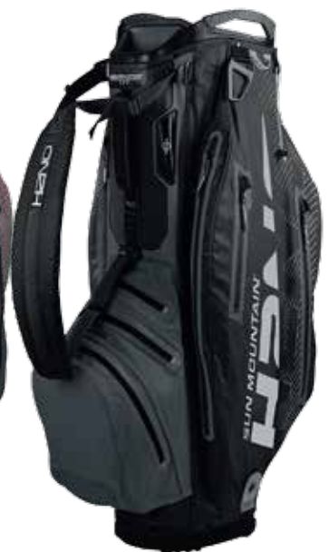
BLACK / GREY