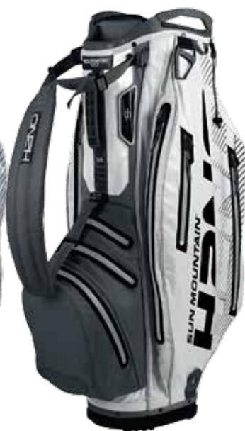
GREY / WHITE