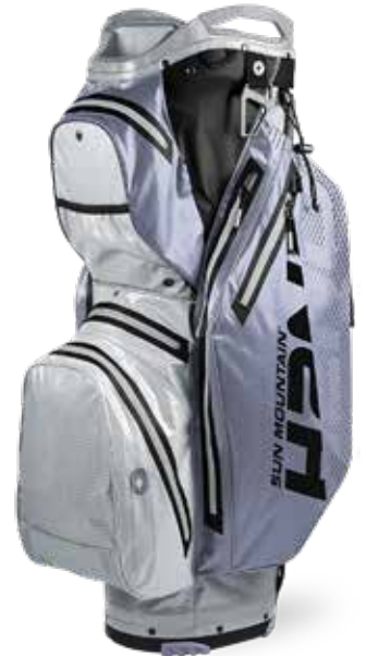
CADET / NICKEL