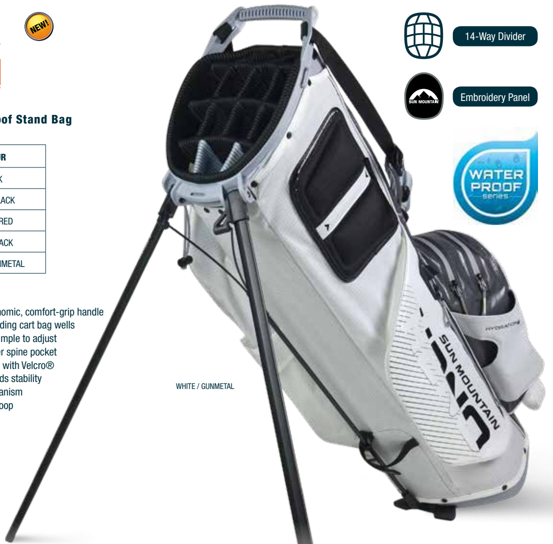
WHITE / GUNMETAL