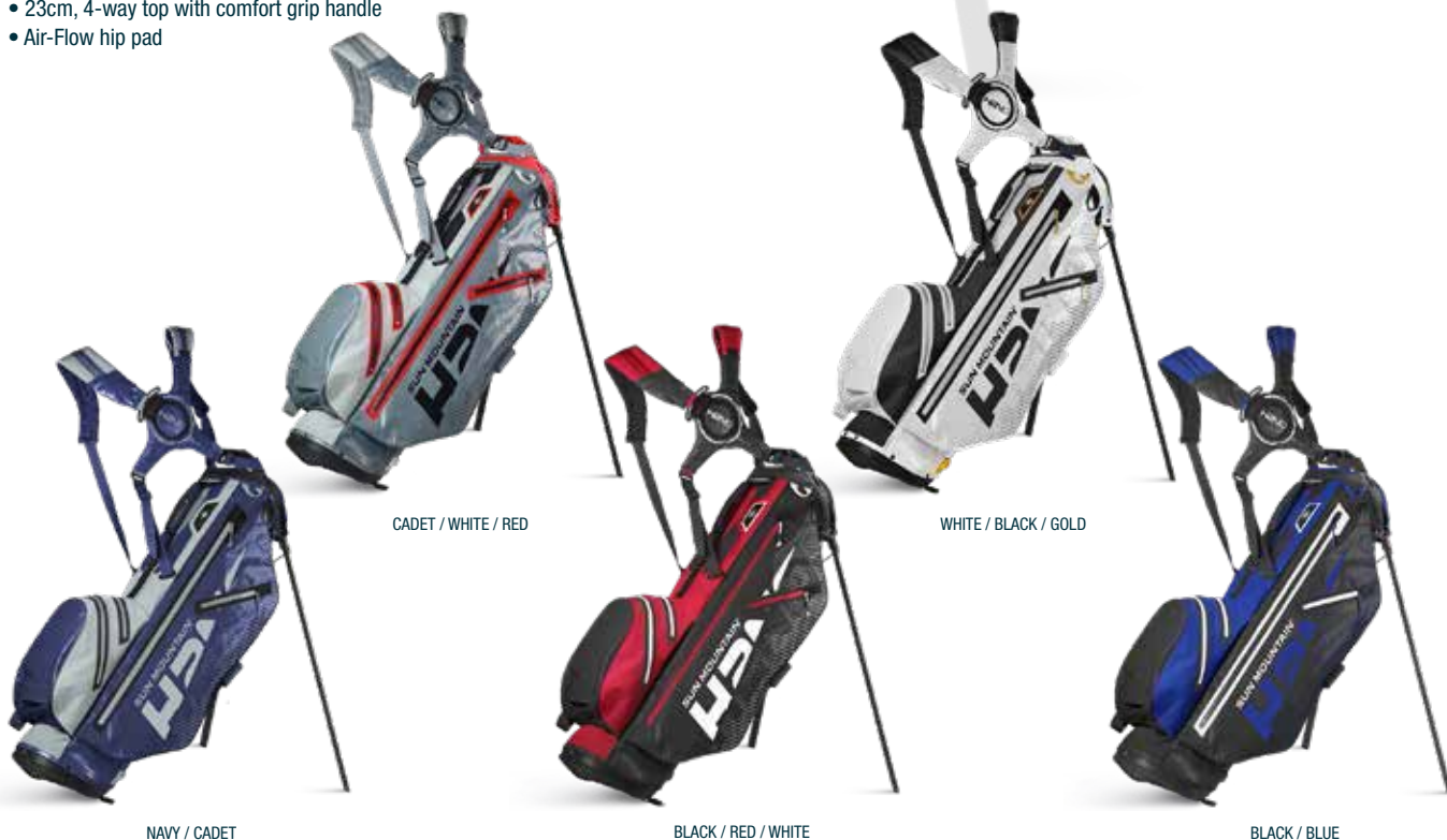
NAVY / CADET