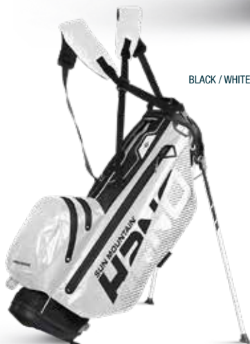
BLACK / WHITE