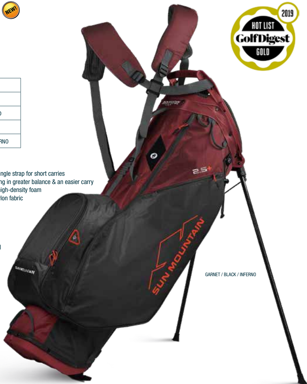
GARNET / BLACK / INFERNO