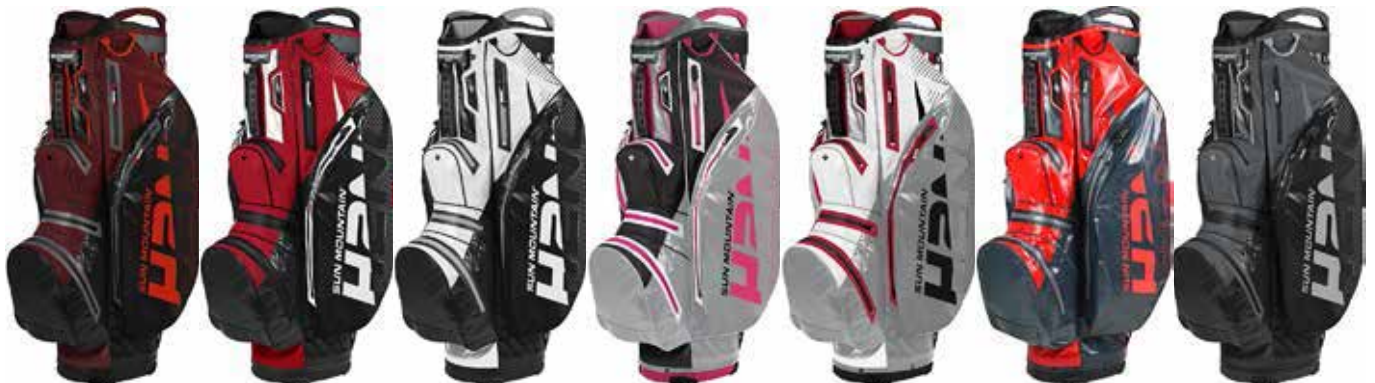
BLACK / GARNET / INFERNO