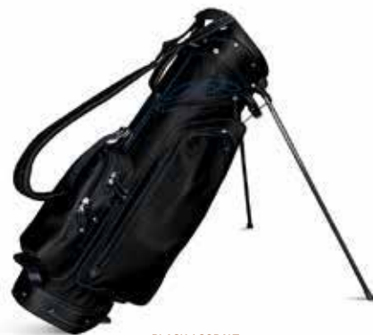
BLACK / COBALT

POS Available - Ask your Brand Fusion Agent