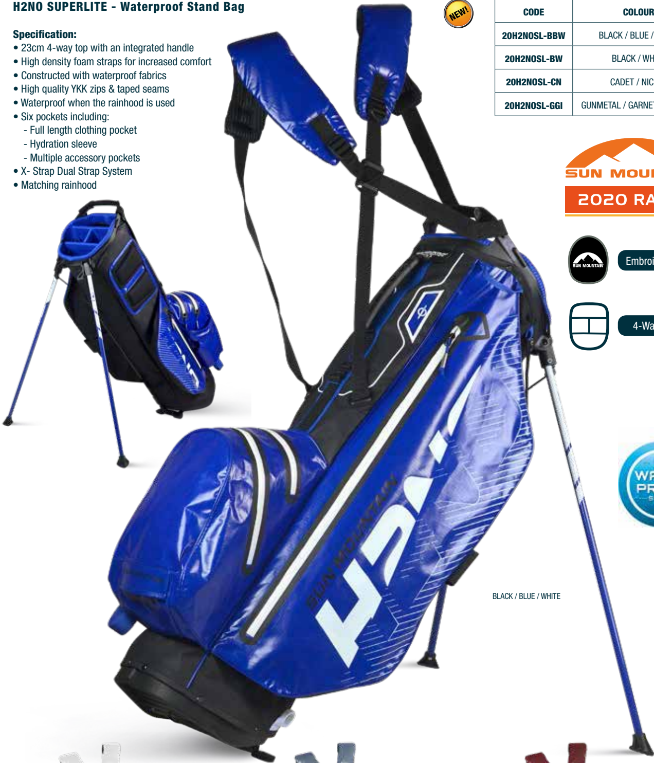
BLACK / BLUE / WHITE