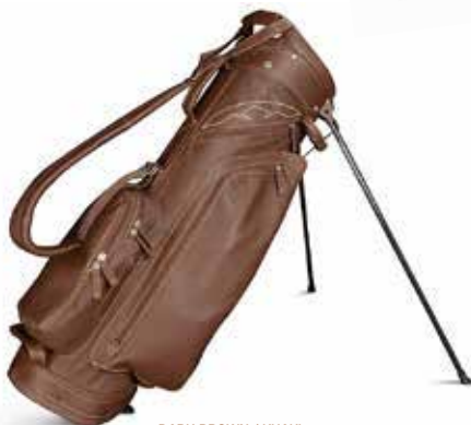
DARK BROWN / KHAKI