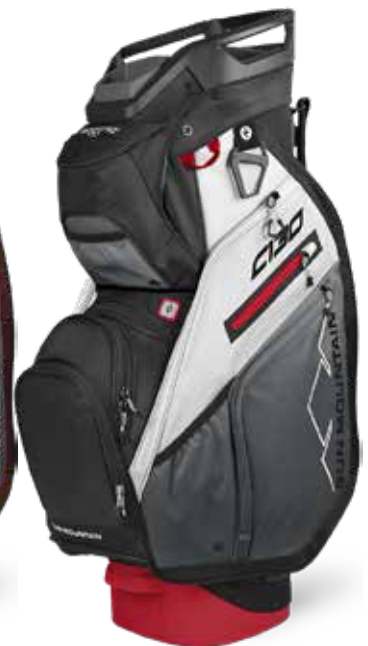
BLACK / GUNMETAL / WHITE / RED