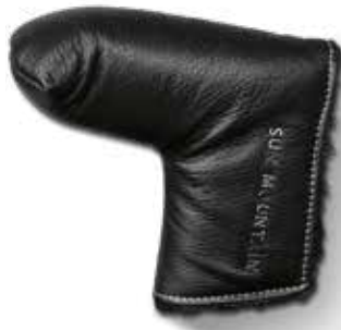
7LEPUT-KW BLACK / WHITE