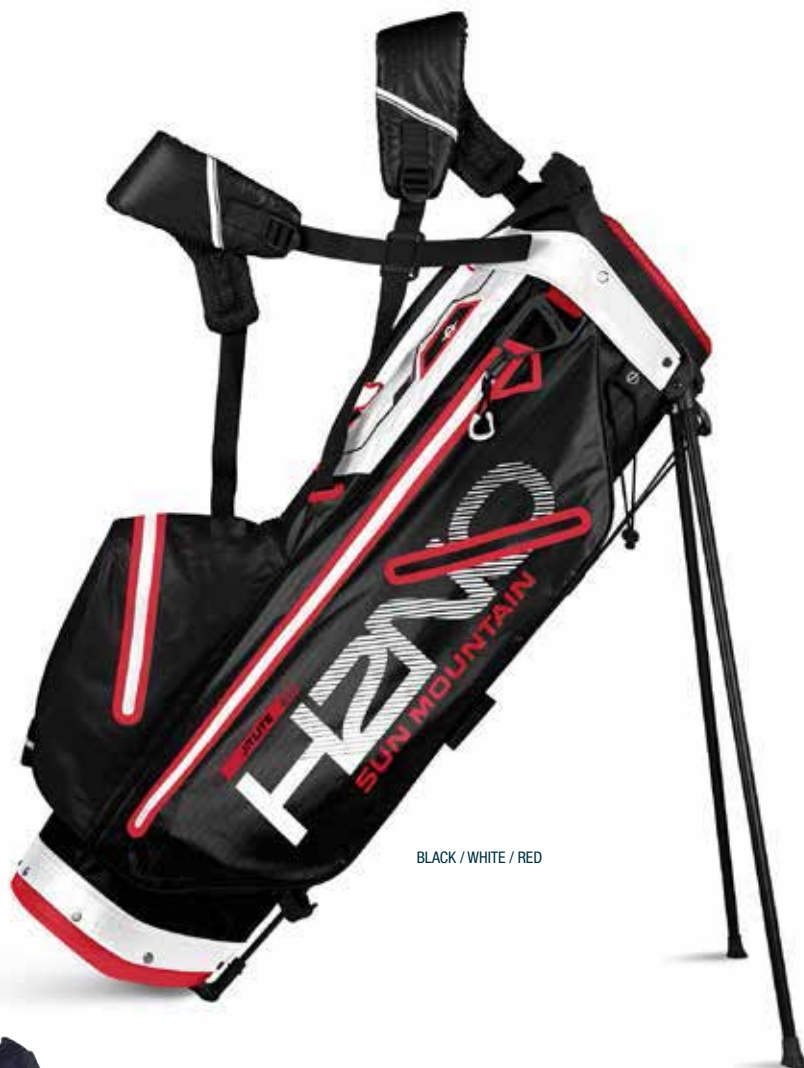
BLACK / WHITE / RED