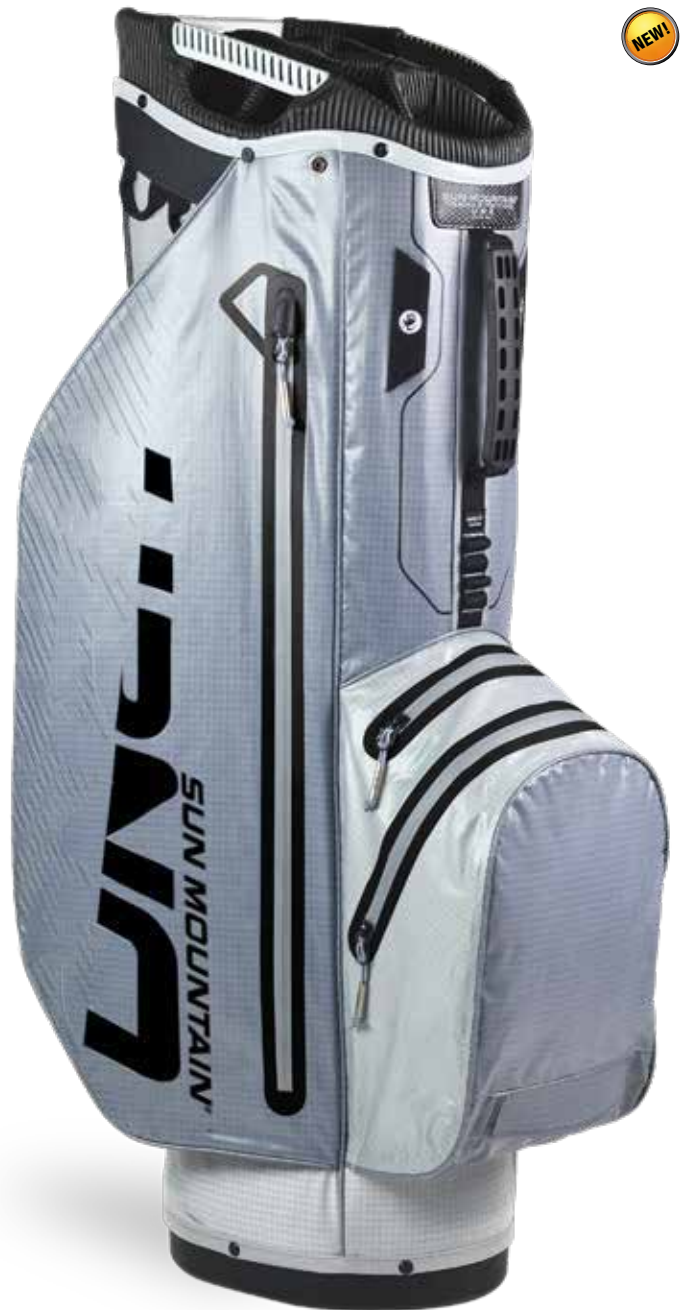
CADET / NICKEL