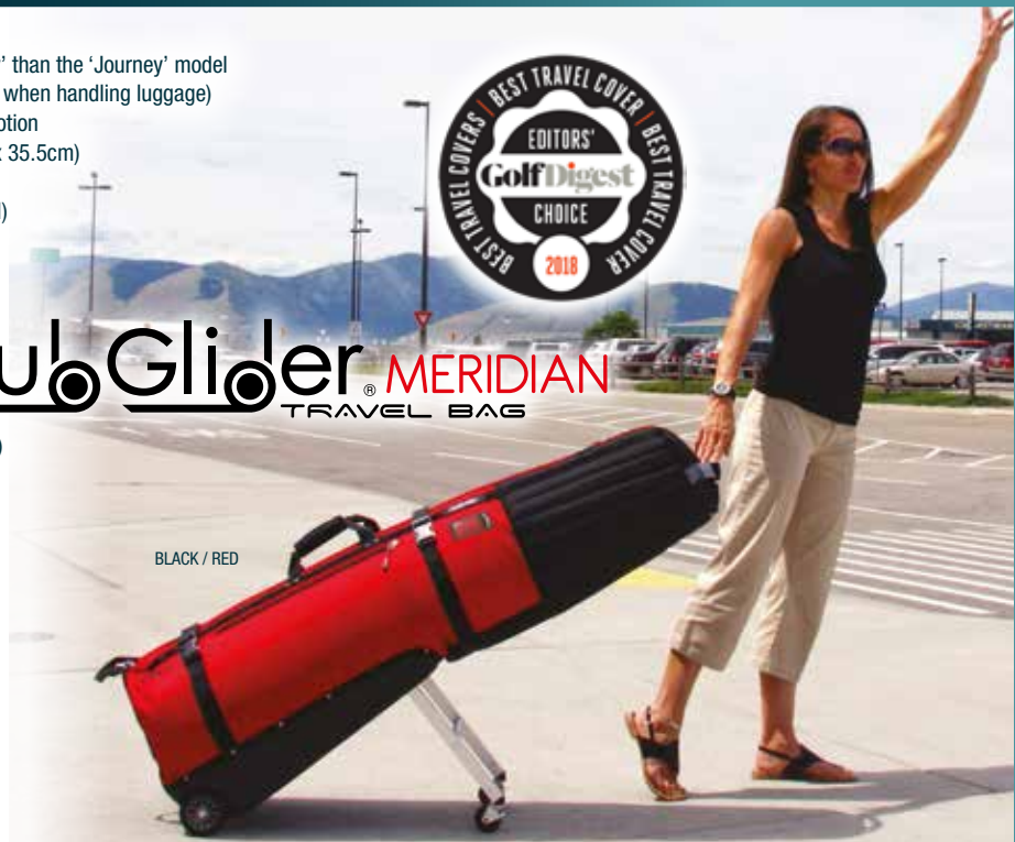
BLACK / RED