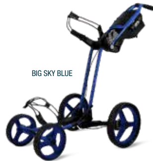
BIG SKY BLUE