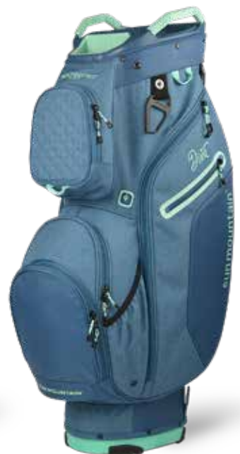
SPRUCE / HEATHER / ICE