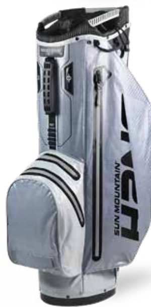
CADET / NICKEL