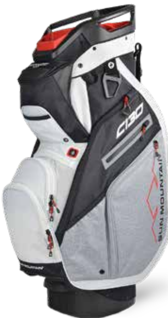
BLACK / CHARCOAL / WHITE / RED