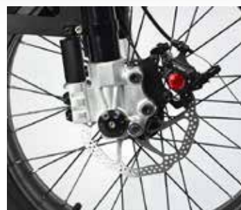
Powerful disk brake