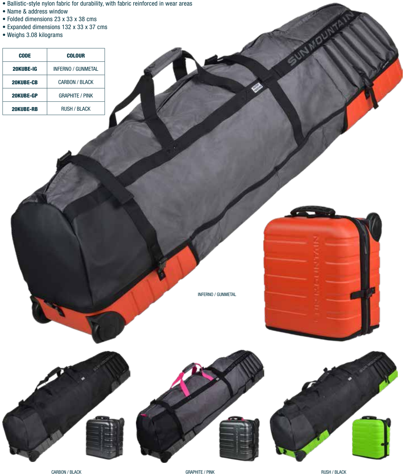
INFERNO / GUNMETAL