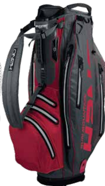
GREY / RED